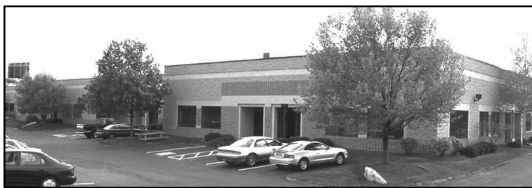
894 Marcon Blvd.